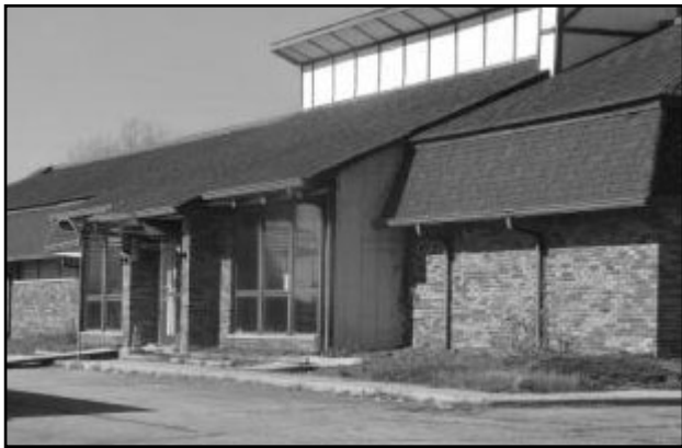
The new home of Indianapolis Baptist Temple is slated to open in June 2006.