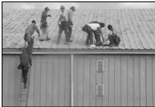
Amish putting the roof on the new IBT.

When summer came, because the high school auditorium had no air-conditioning, they moved to the banquet hall at Jonathan Byrd's Cafeteria, which is approximately twelve miles South in Greenwood, but some didn't follow them because of the distance. There were times that they had to begin services earlier because of prior commitments of the Cafeteria, and some Sundays they had to find other meeting places altogether. One Sunday in particular they couldn't have a morning service at all.