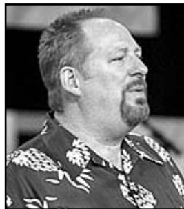
Sadly, Rick Warren is one of the most influential religious leaders in the world today.

"In fact," Warren added, "as a member of the Council on Foreign Relations and Oxford Analytica, I might know as much about the Middle East as you."