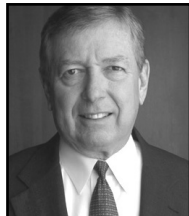
John Ashcroft, Bush's Attorney General, ordered 100 armed Federal Marshals to raid the Indianapolis Baptist Temple on February 13, 2001.