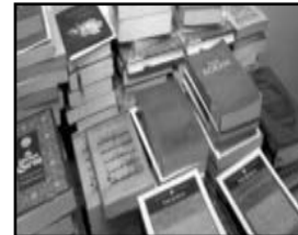
Hundreds of Korans, sent from across the country to be burned at Pastor Jones' church, were returned into circulation

Christian Newswire of Sept. 16, The Christian Defense Coalition and the National Clergy Council had the Qur'ans that Pastor Terry Jones planned to burn on, Sept. 11, sent to the nation's capitol to ensure they would never be burned and to send a powerful message that Christians don't hate Muslims and are praying for them.