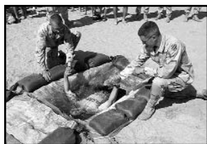
A makeshift baptismal in a Mideastern desert

Samaritan's Purse called this project 'Operation Desert Save'. It generated many wonderful letters from the field. One sergeant said that the music had touched him deeply, "Tears of joy began to flow. I pulled my cap down over my