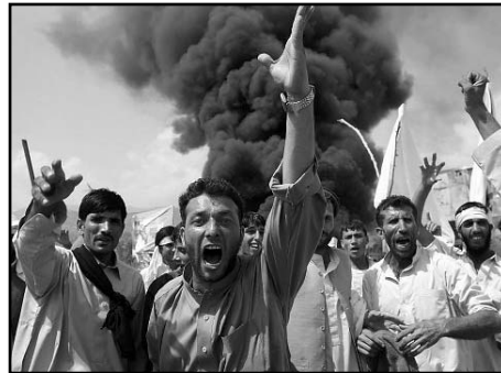
Muslims in Afghanistan were enraged at the threat of the Koran burning and threatened violence against Americans

Moslems don't need excuses for violence against Christians