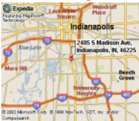
Emerson Ave. N to I-465 West, I-465 West to Indianapolis North (Hwy 31 or East St.) Exit North, proceed on East St. to intersection of East and Madison ( a Y ) continue North on Madison turn right at Madison Ave. Flower Shop to the Manual H. S. parking lot.