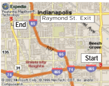
Emerson Ave (N) to I-465 (W) to I-65 (N) to the Raymond St. Exit off I-65 turn left on Raymond to Shelby, turn left on Shelby to Southern (2nd light), turn right on Southern to Madison, turn right on Madison turn right at the Madison Ave. Flower Shop for parking lot to Manual H. S.

And ye shall know the truth, and the truth shall make you free. John 8:32